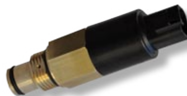
Pall RCA216 differential pressure switch

System Interface: To fit all standard Pall threaded indicator ports