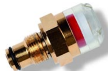
Pall RCA219 differential pressure indicator