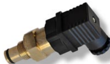
Pall RCA218M differential pressure indicator