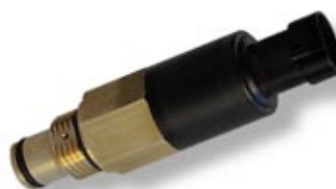
Pall RCA217 differential pressure switch