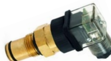
Pall RCA218R differential pressure indicator