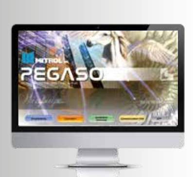
Pegaso is the latest generation CNC for FICEP lines where the PC, CNC and PLC are all integrated into a single circuit board for maximum reliability. Pegaso is based upon a field bus technology using CanBus and EtherCAT for controlling up to 32 separate CNC axes.