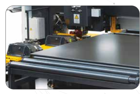
Hydraulic lateral grippers

The infeed and outfeed conveyors are configured to achieve the desired length of plate to be processed starting from the standard length of 6 mt.