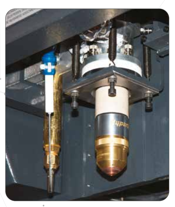
Plasma and oxy-fuel torches